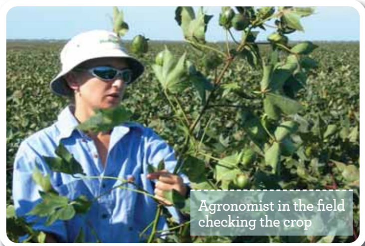
Agronomist in the field checking the crop