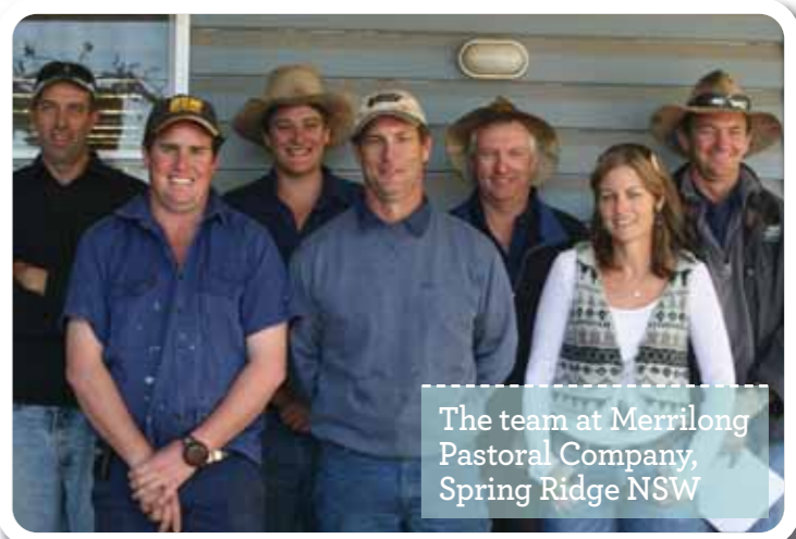
The team at Merrilong Pastoral Company, Spring Ridge NSW