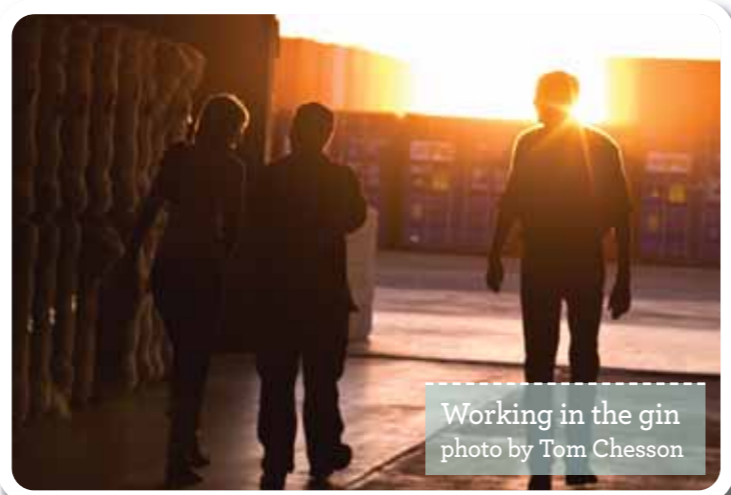
Working in the gin