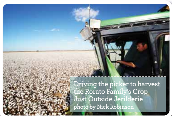
Driving the picker to harvest the Rorato Family's Crop Just Outside Jerilderie