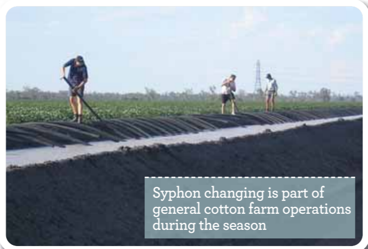
Syphon changing is part of general cotton farm operations during the season