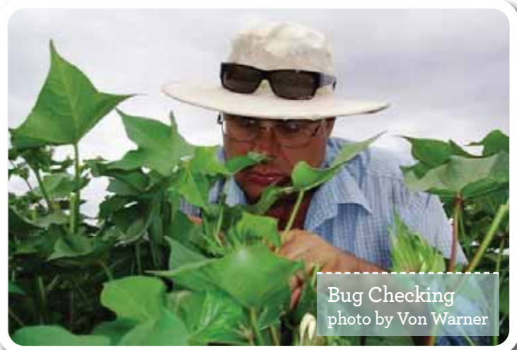
Bug Checking