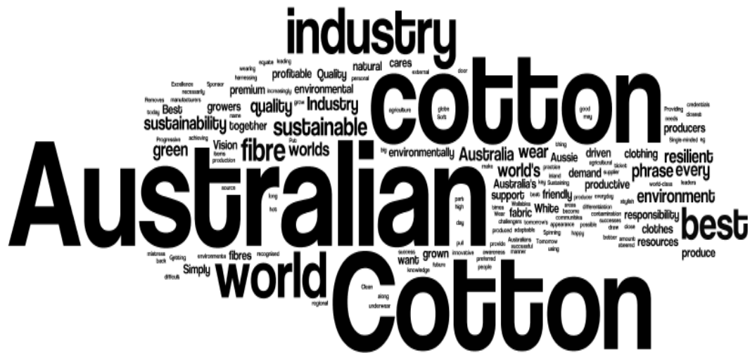
Cloud 1: All words retained, no editing