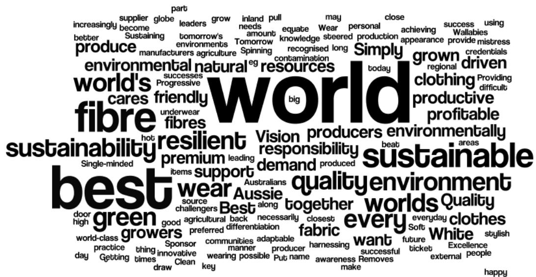
Cloud 2: Words removed: Australian, Australia, Australia's, cotton, Cotton, industry, phrase