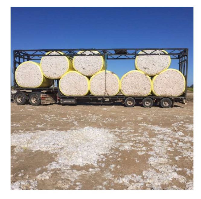
<u>Photograph 3</u> – Bale removed from behind the central tie down.