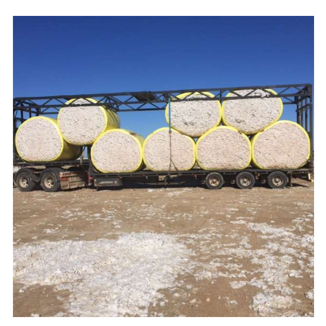
<u>Photograph 4</u> – Bale removed from in front of the central tie down.