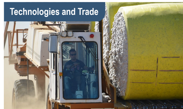
Workers drive efficiency through the use of technology.