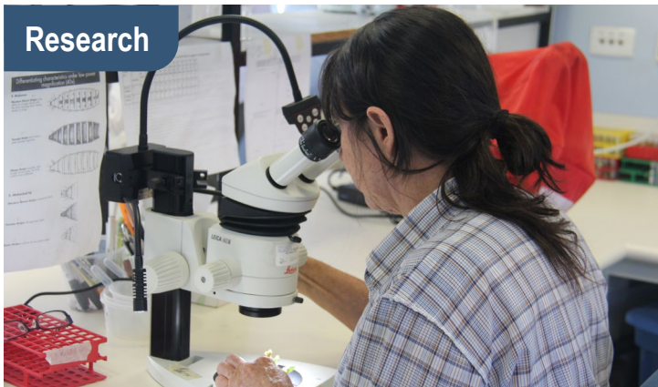
Scientific laboratory research into cotton.