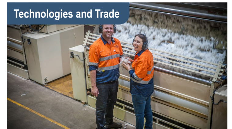
Gin staff oversee processing cotton into its final export product.