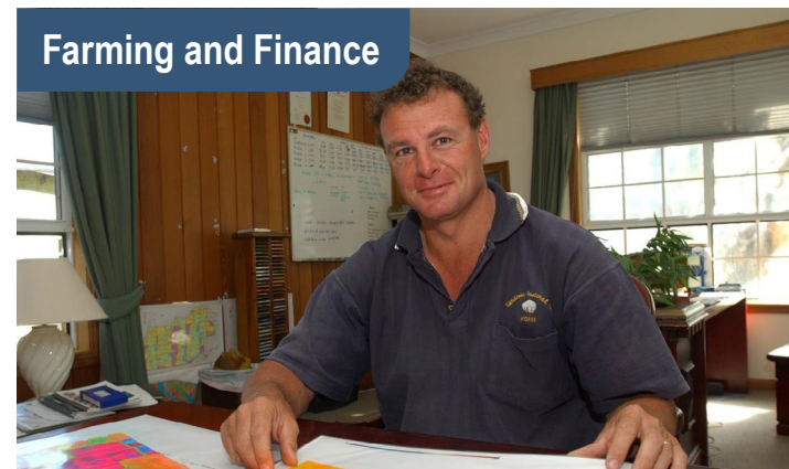
Cotton grower in the home office on farm.