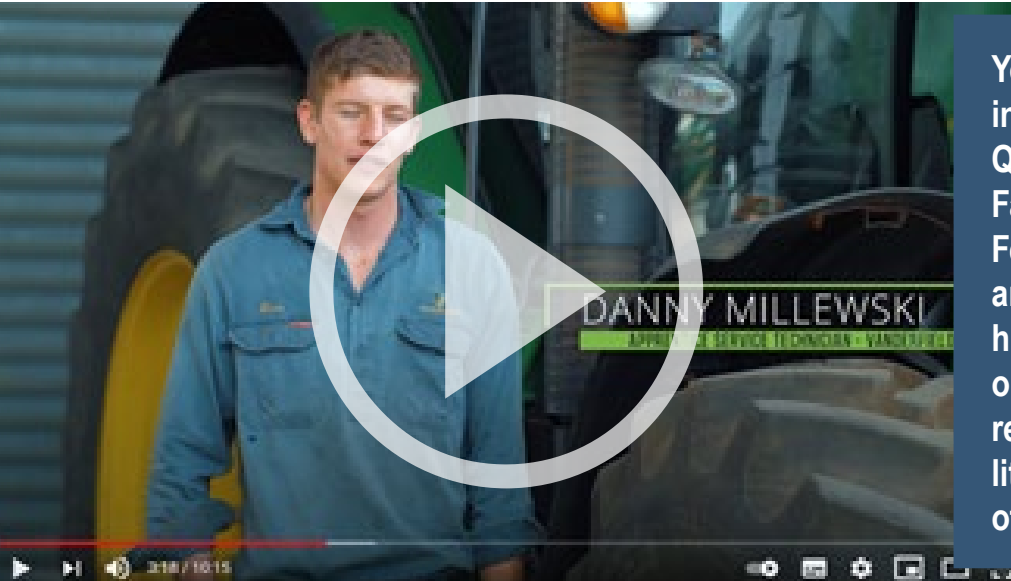
Your Career in Agriculture. Queensland Farmer's Federation gives an overview of the huge variety of opportunities for rewarding work in little-known areas of agriculture.

Are you searching for your right career in agriculture and suggested learning pathways? Investigate these useful videos and links.