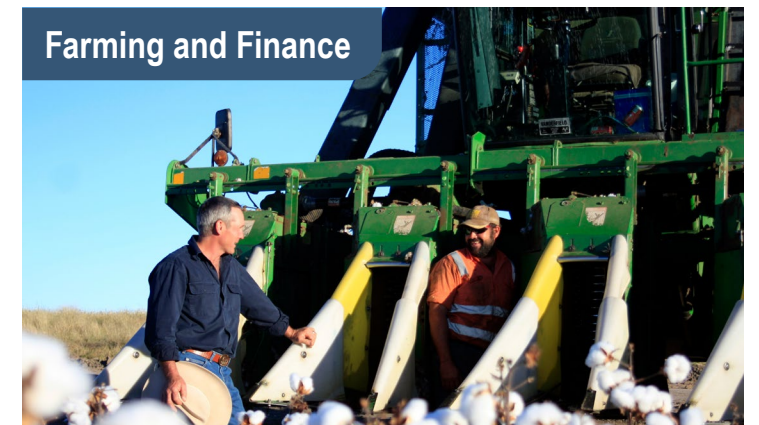
Growers manage a team of on-farm workers.