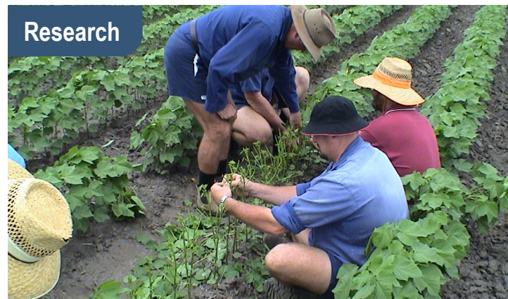
Plant breeding researchers working in the field.