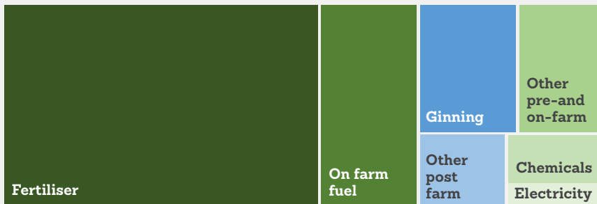
Source: Visser, Carbon Footprint of Australian Irrigated Cotton 2019. CRDC research.