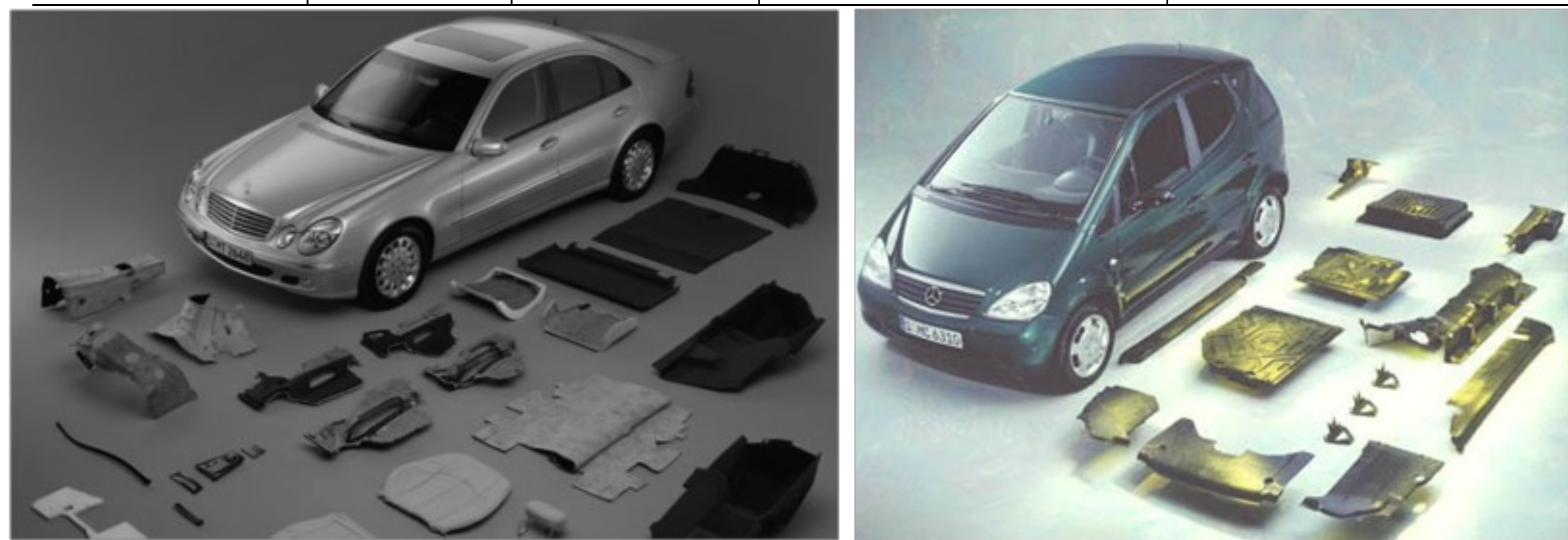
Plant fibres are used to make parts in Mercedes-Benz E-Class and A-200 cars.